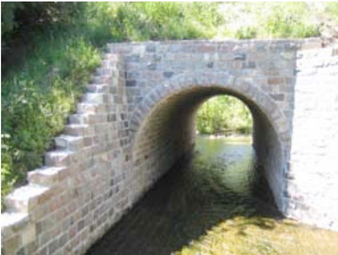
East end of completely restored culvert façade and adjoining wing walls.