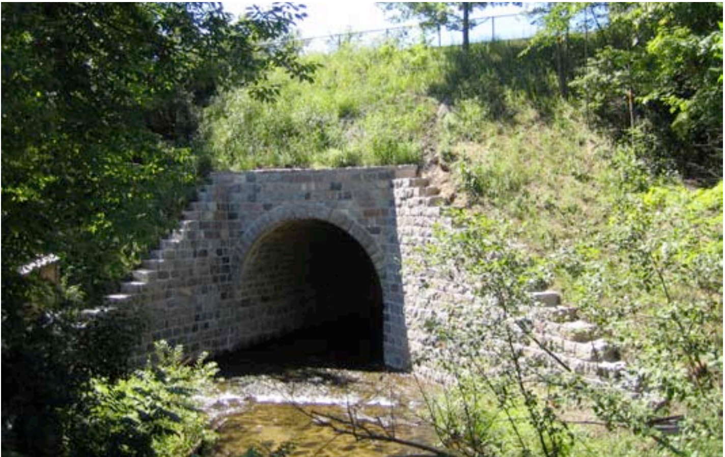
Landscape restoration and stabilization in steep erodible side slopes.