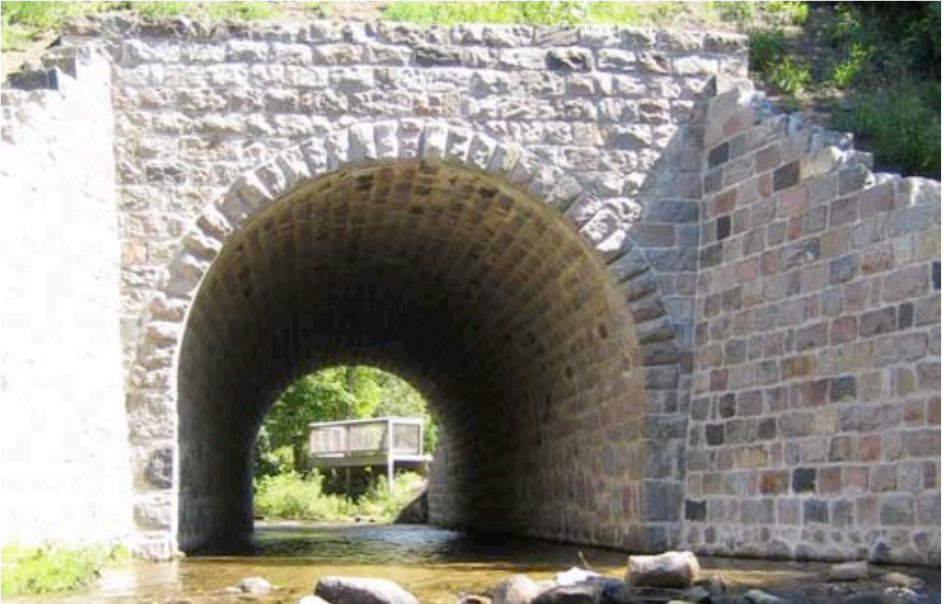
The clear flowing Stegman Creek, a tributary of the Rouge River, which flows under the 16' wide by 75' long Historic Culvert, is a classified trout stream.