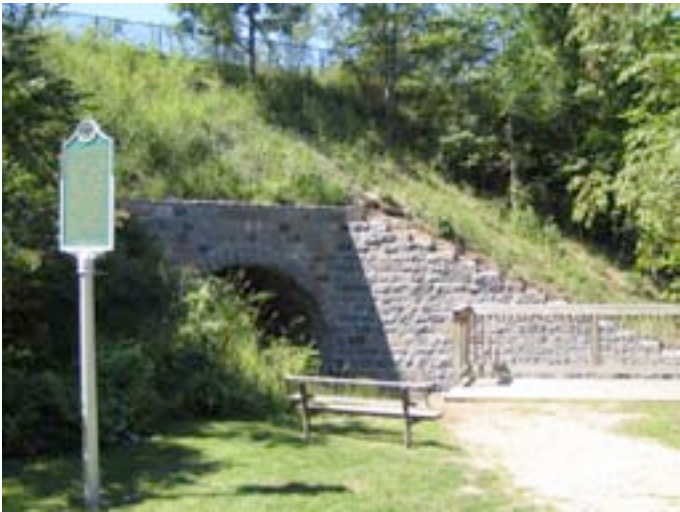
National Register of Historic Places marker near East end of culvert.